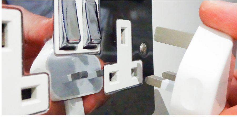
ASTA Certificate pre 2020

first practical incandescent light bulb. Our logo reflects technology and progress. But our identity is much more than just a logo and colour palette. Behind it lies our Customer Promise – Intertek Total Quality Assurance expertise, delivered consistently with precision, pace and passion, enabling our customers to power ahead safely – as we firmly position Intertek as the trusted partner for end-to-end Total Quality. Assured.