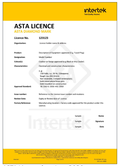
ASTA Licence from June 2020